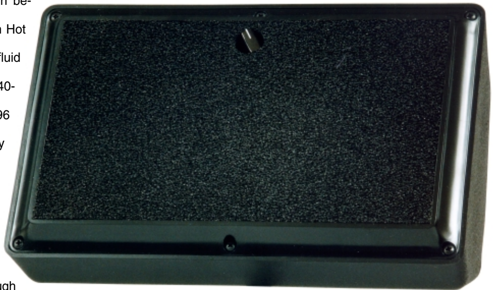
Hot Spot VC (with optional volume control)