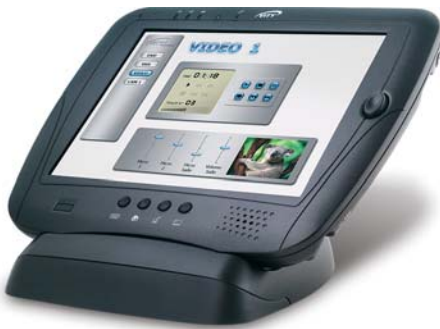
Tactum XP 360 with its optional cradle SDKTOP 360