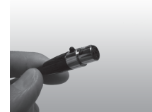
TA4-F for most Shure® wireless transmitters.

Do NOT attempt to re-terminate the microphone yourself. Making physical changes to the CO-7, such as changing the cable termination or electronics, will void your warranty.