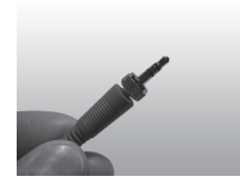
3.5mm locking mini connector for Sennheiser® Evolution wireless transmitters.