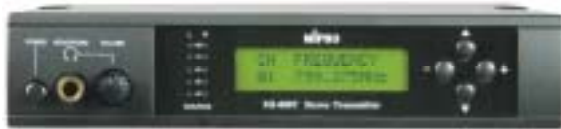
MI-808T Front Panel